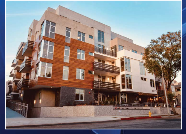
Empire at Norton, West Hollywood

For construction, bridge, and mini-perm loan requests, call (213) 673-8200.